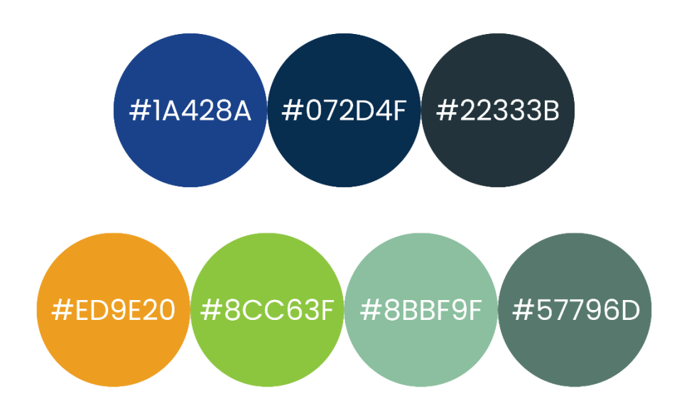
Figure 4: MATISSE colour palette (example figure)