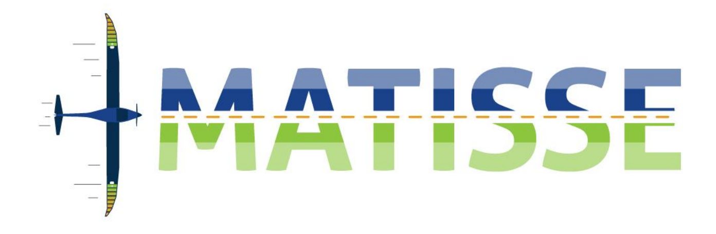
Figure 3: MATISSE project logo.

The project logo is the main visual element: